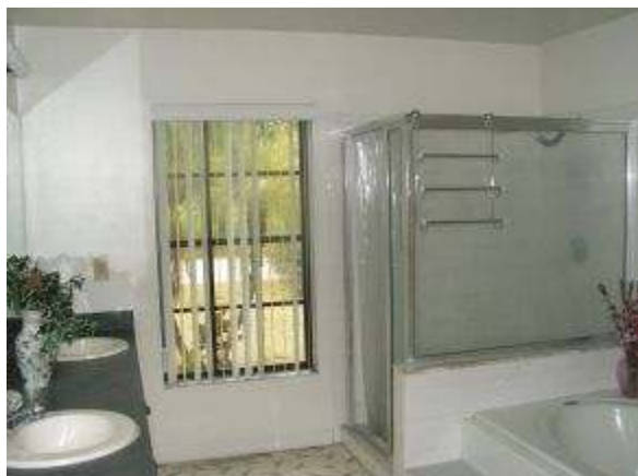
Garden Tub and Separate Shower