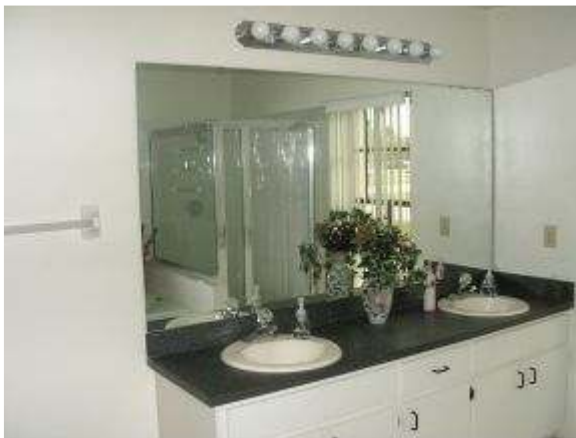
Master Bath Separate Sinks